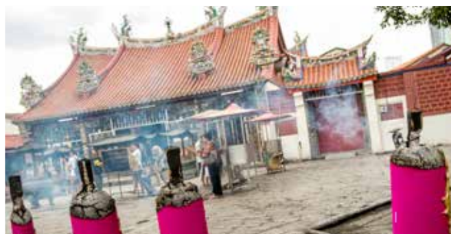
Goddess of Mercy Temple