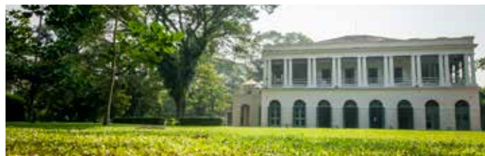
Suffolk House

George Town's landscape, dominated by Chinese storefronts, also features swanky shopping complexes, refurbished Chinese manors, rowdy pubs and artsy boutiques, cafés and studios. The city is also a popular expat enclave. Shangri-La's Rasa Sayang Resort offers free shuttle services to the UNESCO heritage city of George Town, located 20 minutes away from the hotel.