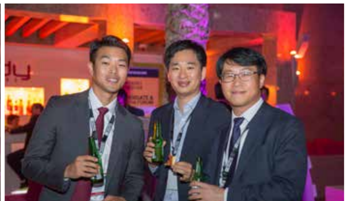
Global Attendance at the Condensate & Naphtha Forum - Networking at Dubai 2016 Cocktails